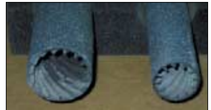
Fig. 3 — Finned silicon/silicon carbide composite radiant tubes have been proven to reduce fuel consumption.