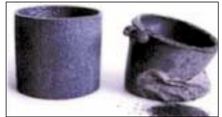
Fig. 2 — Results of high-temperature creep testing. The tube on the left is a silicon/silicon carbide tube, and the Alloy 600 tube on the right shows the deformation at loads replicating the weight of the tube. Test by High Tech Ceramics, Alfred, New York.

An alternative is ceramic composite tubes. The heat transfer from the tube is a function of the tube temperature to the fourth power. Therefore, a tube