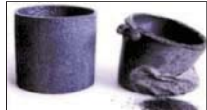
Fig. 2 — Results of high-temperature creep testing. The tube on the left is a silicon/silicon carbide tube, and the Alloy 600 tube on the right shows the deformation at loads replicating the weight of the tube. Test by High Tech Ceramics, Alfred, New York.

An alternative is ceramic composite tubes. The heat transfer from the tube is a function of the tube temperature to the fourth power. Therefore, a tube