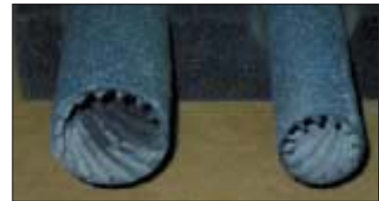
Fig. 3 — Finned silicon/silicon carbide composite radiant tubes have been proven to reduce fuel consumption.